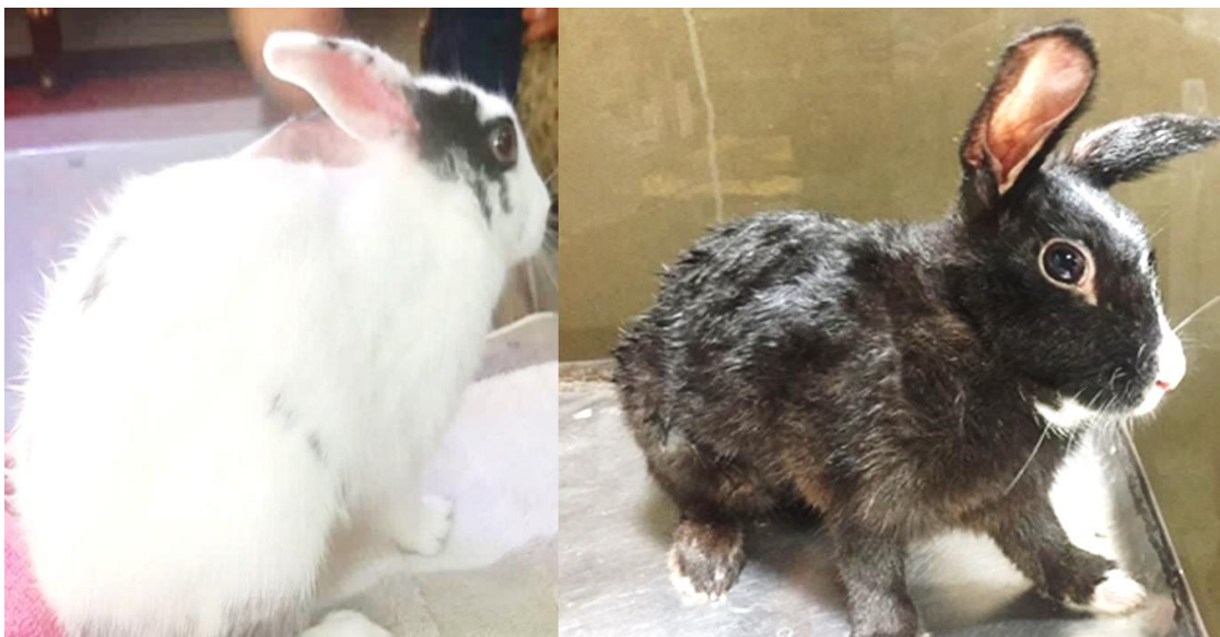
Figure 1. Healthy female short-haired rabbits, aged 20 to 24 months, with normal vital parameters before spaying

From 2022 to 2024, five female short-haired rabbits, averaging 20-24 months in age and weighing between 1.5 kg and 1.7 kg, were presented to the Teaching Veterinary Hospital, Chittagong Veterinary and Animal Sciences University (CVASU), Chittagong, Bangladesh, for spaying procedures. The critical parameters, specifically temperature, respiration rate, and heart rate, were recorded at 102°F (38.8°C), 50 breaths per minute, and 130 beats per minute, respectively. All five rabbits exhibited no signs of disease or distress (Figure 1).